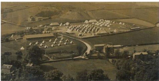
⑩ Returning along Baslow Road looking north

Also looking east but obscured by the current pond and surrounding trees is the old carriage entrance used until 1943. This is best viewed from inside the wood.