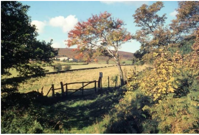
⑨ The end of the wood, looking west...