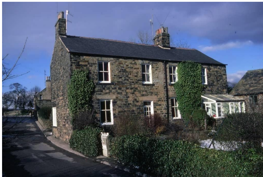
③ Top of Trolley Hall Lane: 3 cottages + sweet shop.