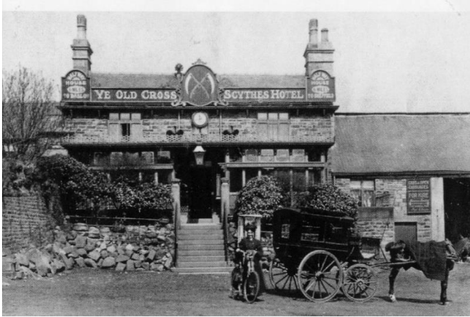
① Start the walk at the (Olde) Cross Scythes