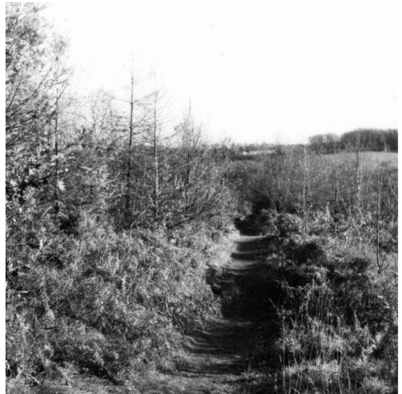
Inside Gillfield Wood (1974) looking along the main path east toward Woodthorpe.