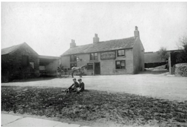
The Fleur-de-Lys around 1900.