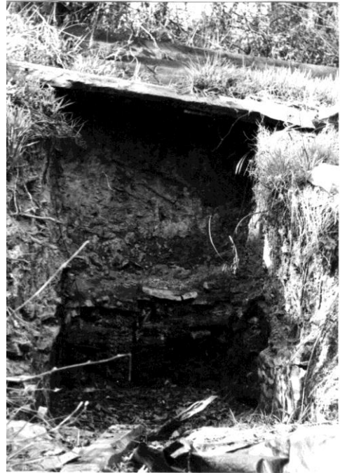
Bob's 'dugout'— possibly for shooting pheasant.