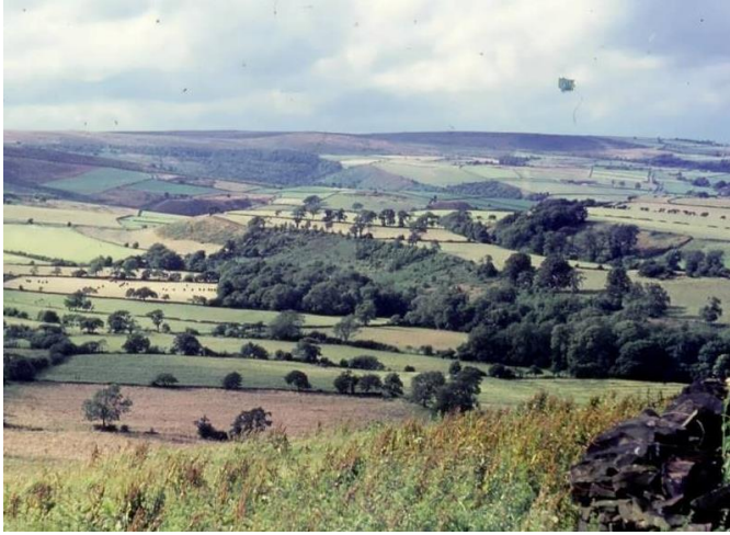
⑥ Looking NW with larger trees on the southern side (Holmesfield).