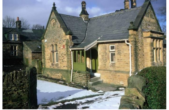
... and Totley Hall Lodge (1887), a coachman's cottage.