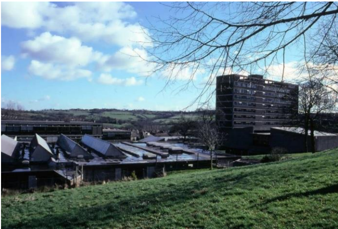
⑤ Totley College (1955) also owned...