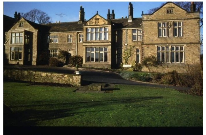
...Totley Hall (built in 1623)