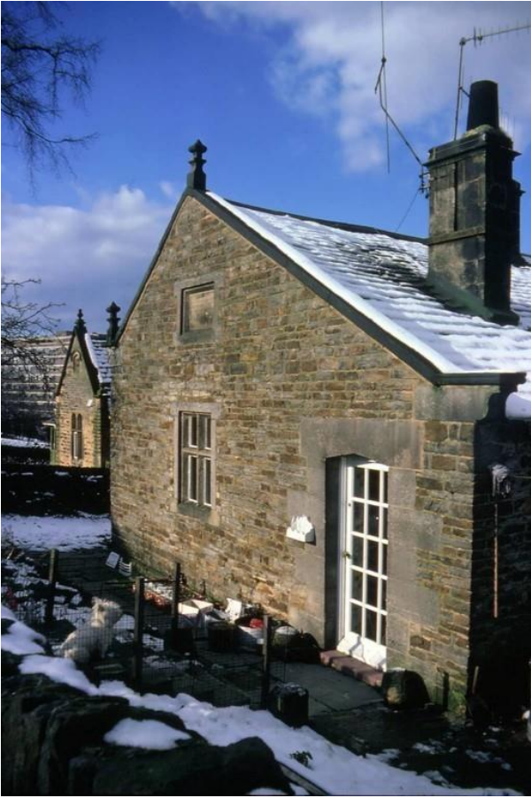
④ The old village school (1827) ...