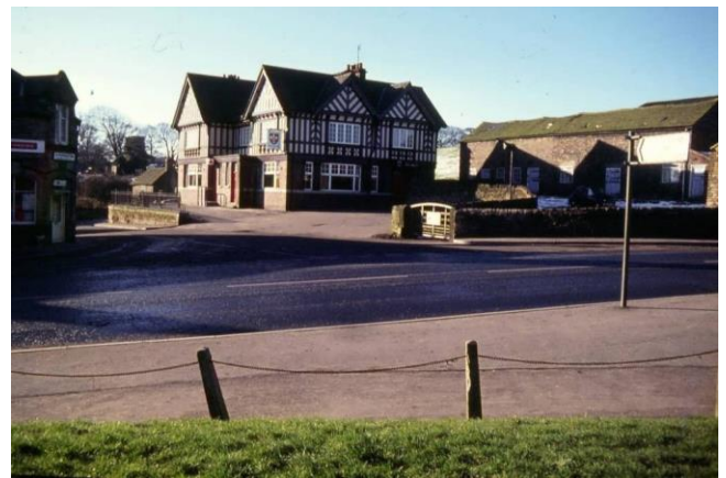
Fleur de Lys (1974)