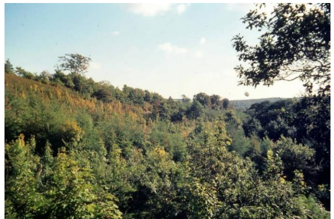
The early conifer plantation near the terminus.