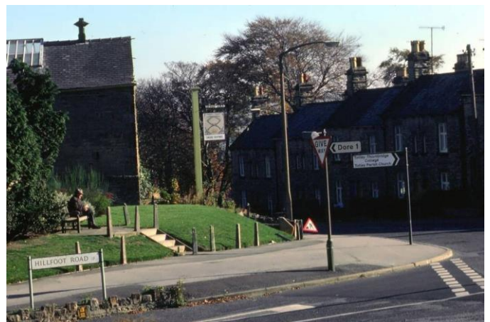
Resting at the crossing on Hillfoot Road (1974).