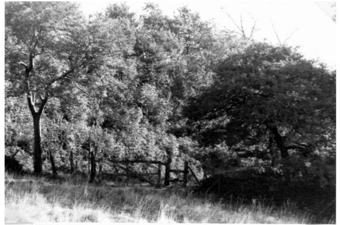
...looking east back into the wood.