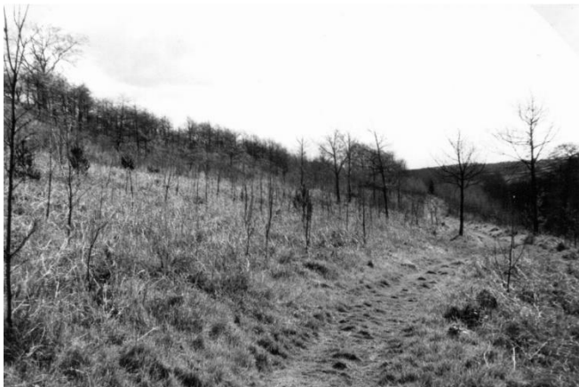
⑧ Looking east across Gillfield Wood 1974.